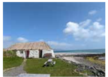
Berneray in summery conditions

'This summer will see the installation of new windows in the hostel at Berneray. This is a job which has to be done during the summer months when it is (hopefully) dry and should cause no inconvenience to hostellers.' (Editor: Jim McFarlane) [ Watch this space for a repeat in the Summer of 2049 after this year's replacement ]