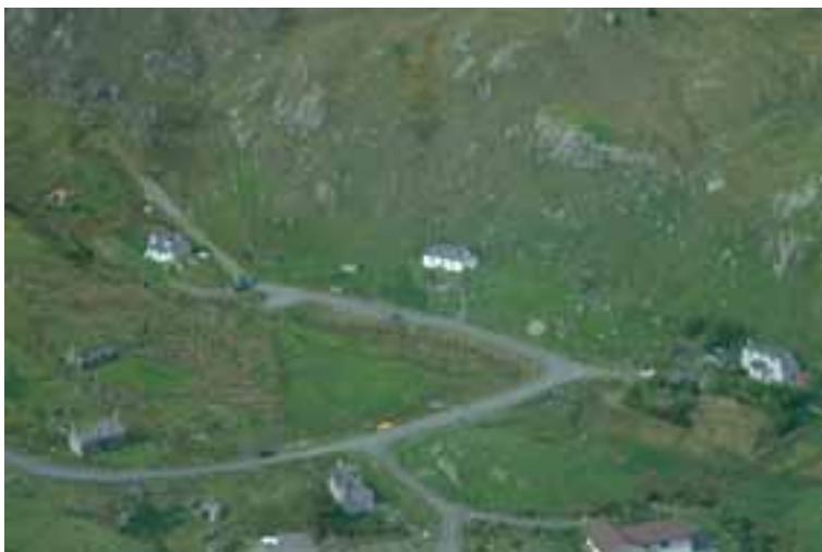
Rhenigidale in 2002

Improvements were also made to the outhouse toilet/washroom.