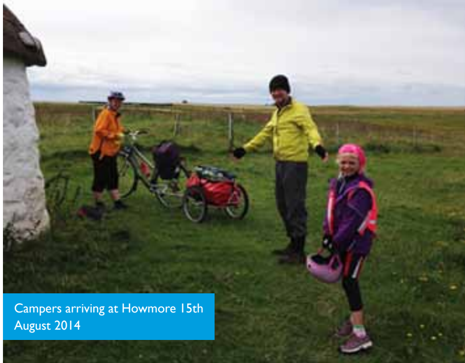
Campers arriving at Howmore 15th August 2014

The new shower and toilet in the old hostel building look splendid and have greatly increased the comfort and amenity of the shared sleeping accommodation.